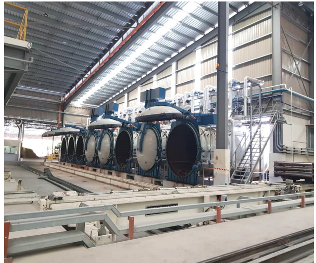
Exhibit 6: Steam Curing