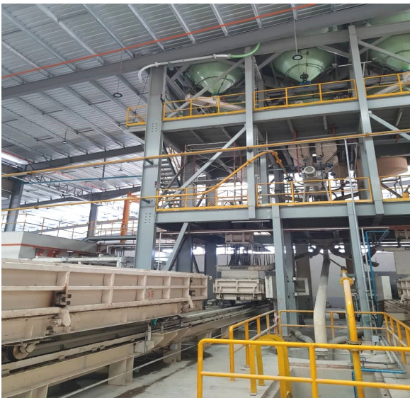
Exhibit 3: Mixing and Pouring of Raw Materials