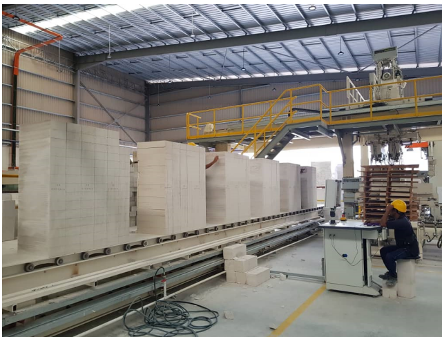
Exhibit 7: Quality Checking