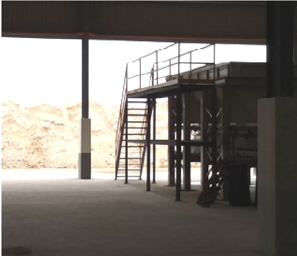
Exhibit 1: Loading Bay for Raw Materials