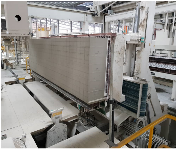
Exhibit 5: Block Cutting