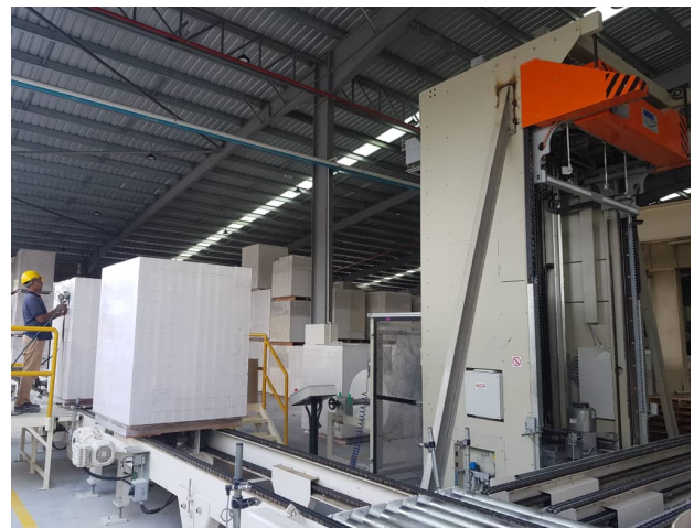
Exhibit 8: Packing