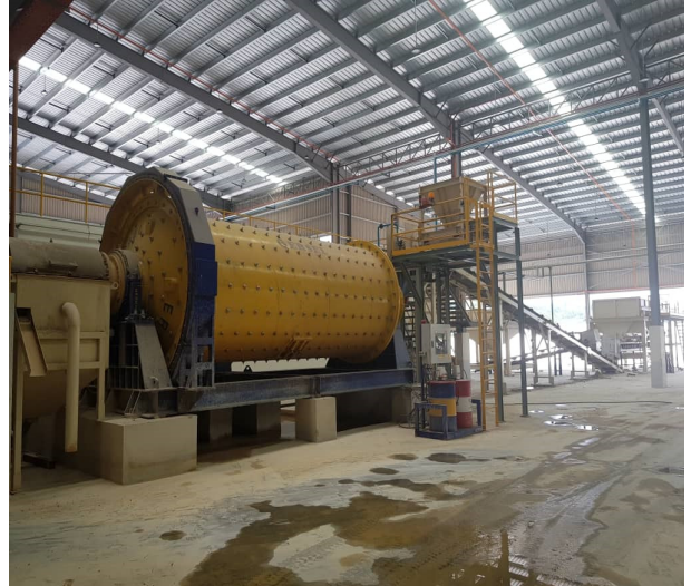
Exhibit 2: Sand Milling